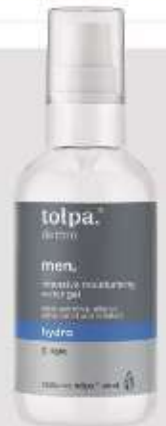
Tolpa men hydro intensive moisturising gel, £9.99, lloydspharmacy.com