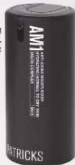
AM1 Anti-Aging Moisturizer, £88, patrickproducts.co.uk