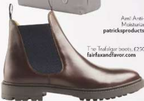
The Trafalgar boots, £250, fairfaxandfavor.com