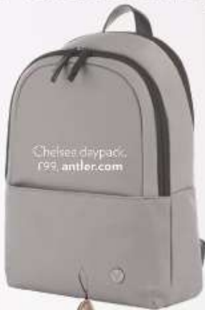
Chelsea daypack, £99, antler.com