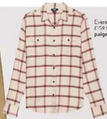
Everett shirt, £159.99, paige.com