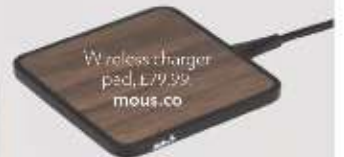
Wireless charger pad, £79.99, mous.co