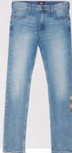
Lennox trousers, £156.99, paige.com