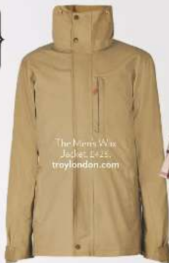
The Men's Wax Jacket, £425, troylondon.com