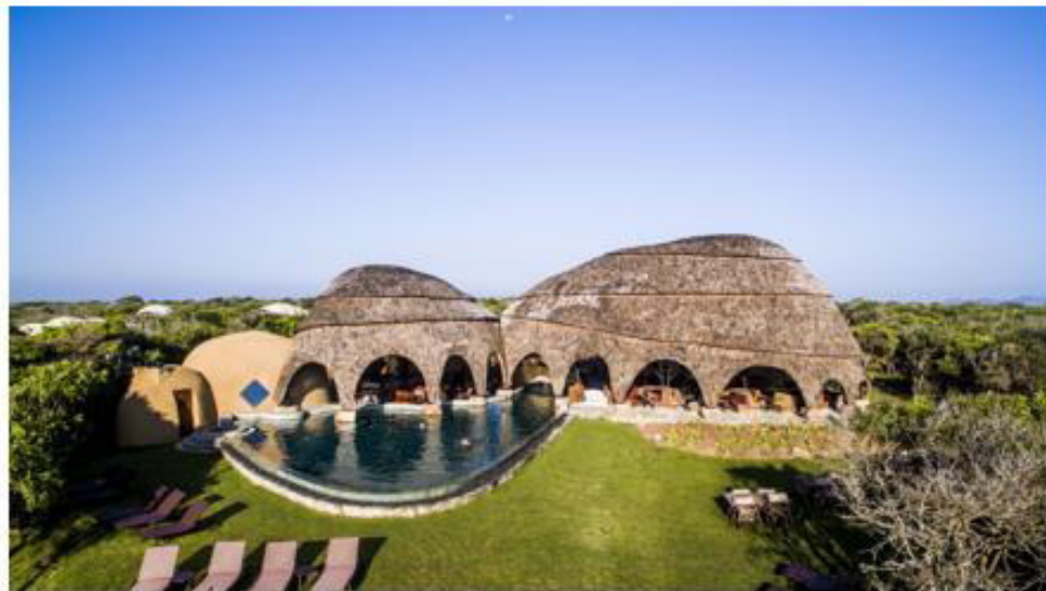
WILD COAST TENTED LODGE

Until recently, the choice of accommodations in the Yala wilderness had been limited. Opened in November 2017, Wild Coast Tented Lodge joins a pocket of new luxury hotels in the area, pioneering an eco-approach to luxury. It's the third luxury property in the Resplendent Ceylon collection, which is owned by the Fernando family, Sri Lanka's most prominent tea producers and founders of Dilmah Tea. The main draw to Wild Coast Tented Lodge is its location; just a short drive from the main entrances of Yala National Park, bordering the Indian Ocean.