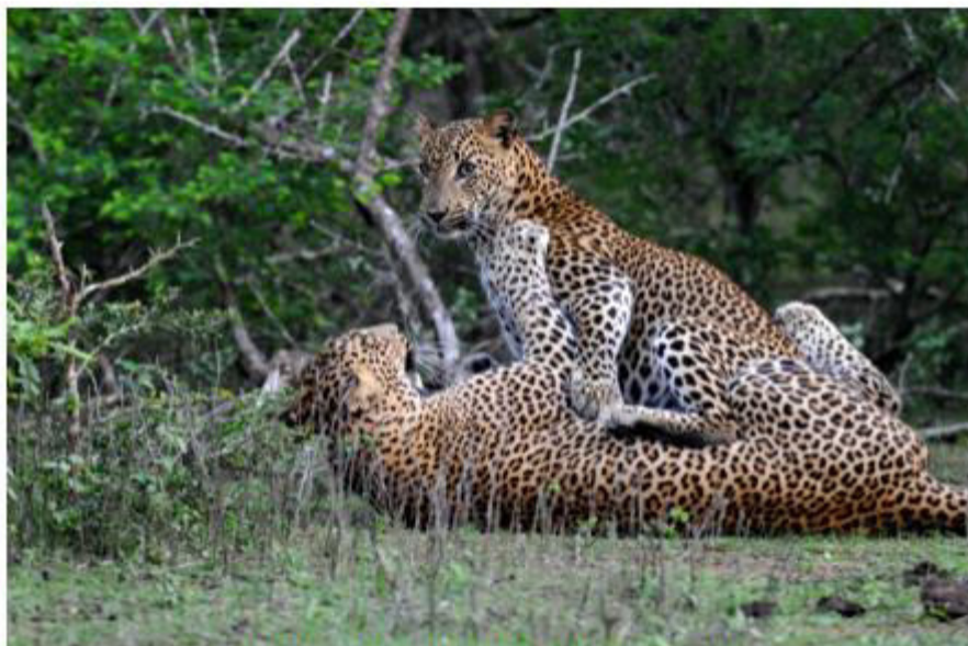
SRI LANKAN LEOPARDS IN YALA NATIONAL PARK

As the trend towards eco-conscious travel grows, wildlife safaris form the highlight for most staying at Wild Coast Tented Lodge, the latest edition to the Yala southeastern coastline, a jungle escape full of creature-comforts. With the option of two game drives a day (one at dusk and one later in the afternoon), off-road vehicles whisk explorers to the quietest corners of Yala National Park, while expert guides talk through the behaviour and characteristics of resident flora and fauna, including wild elephants, sloth bears and those elusive Sri Lankan leopards. Without noticing, hours pass aboard the travelling classroom as passengers settle into awe.