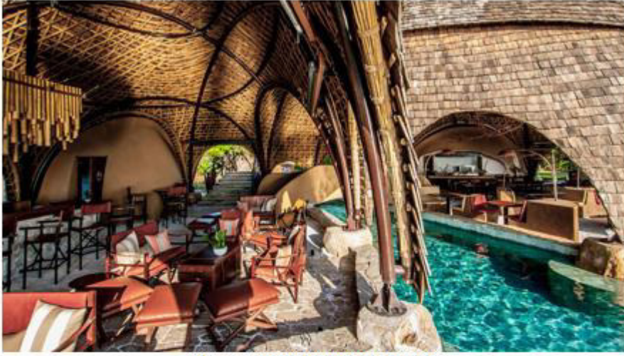
THE RESORT'S BAR AND RESTURANT