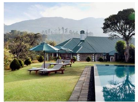
From left: Cape Weligama works closely with the local community on beach cleanliness; Ceylon Tea Trails is a series of restored plantation bungalows.